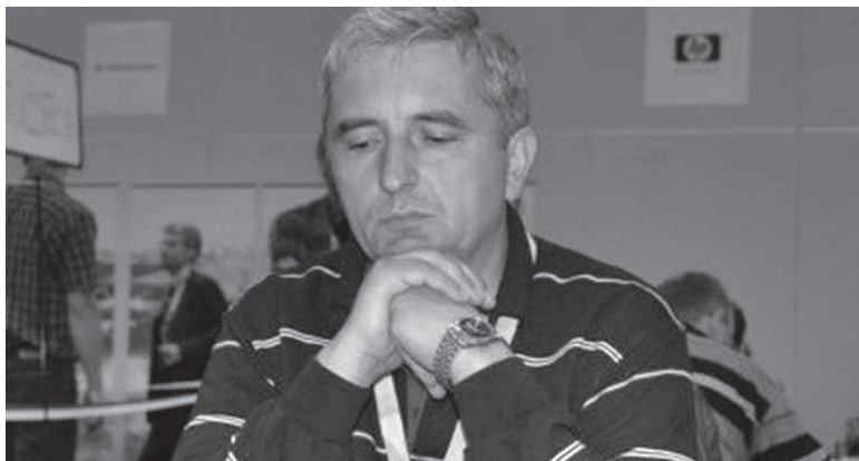
Zdenko Kozul: the Croatian GM and 2006 European champion likes playing 3...Na5 against weaker opponents and can point to a 100% result

Conclusion: It looks simple, and it is. But in practice it is Black who can count on having far greater chances. More than 50% of players fall down the simple move 4.c3.