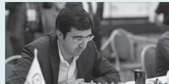
With his super performance (4.5 out of 5) Vladimir Kramnik led his team Siberia to victory in the cup