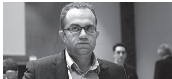
Pavel Eljanov: one of the heroes of the World Cup